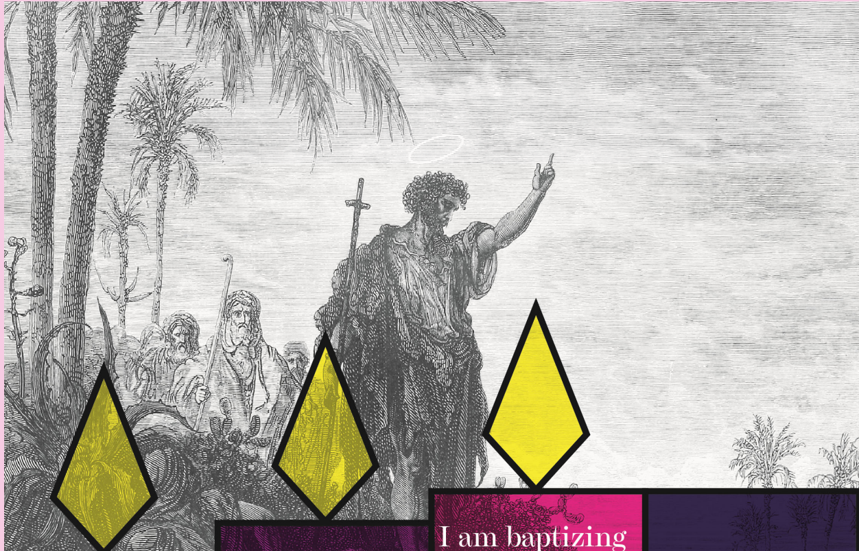
John the Baptist Preaching in the Wilderness Gustav Doré (French, 1832-1883) 1867

I am baptizing you with water, but one mightier than I is coming. I am not worthy to loosen the thongs of his sandals.